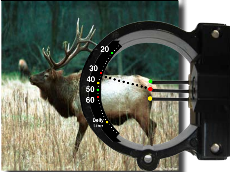
RANGE red pin